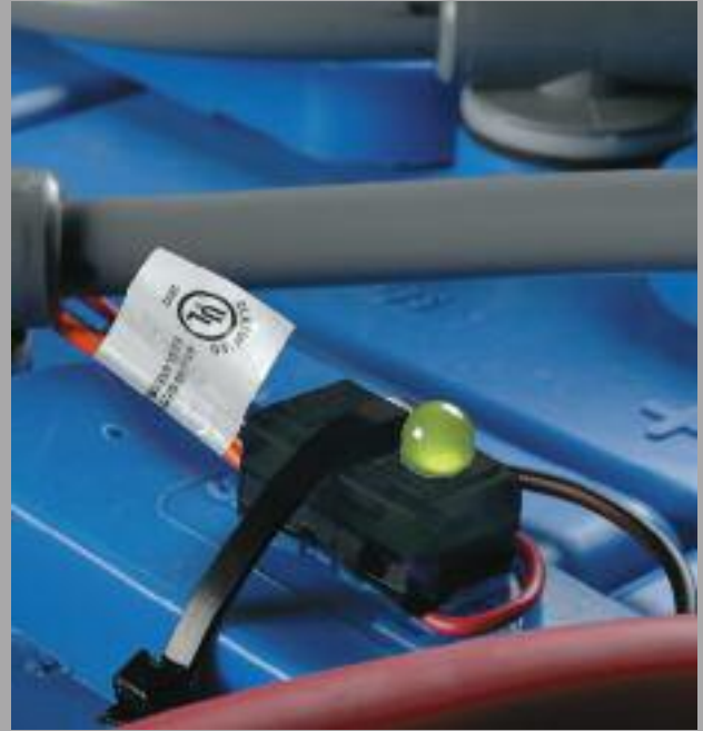
Green Light = Water Level is OK