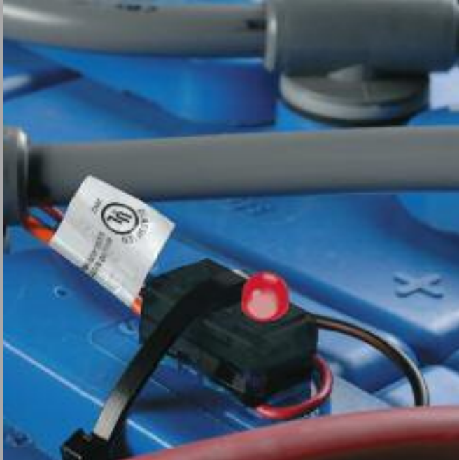
Red Light = Water Required

Let your batteries tell you when they need watering